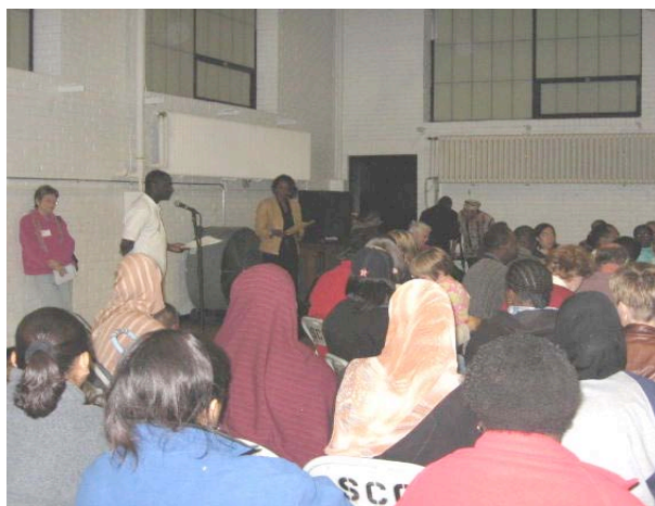
Community members speak at Minneapolis forum.

The Early Childhood Caucus hosted a second year of community forums this fall. In 2004, forums were held in 14 different cities throughout Minnesota. With funding from The Sheltering Arms Foundation, the Caucus was able to continue this effort and plan community forums in 8 cities in 2005. The events included 29 different legislators and hundreds of Minnesota citizens. The purpose of the forums was to create a dialogue between legislators and community members about how to continue to support young children and their families. This year was a great success! With half of the number of forums this year as compared to 2004, there were nearly the same total number of community members in attendance, and the number of legislators present actually increased. Without a doubt, interest and involvement in early childhood issues is growing in Minnesota.