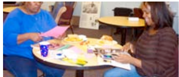
Northside staff help at parent night

A BEAM coach is currently working with four Pre-K teachers at the Northside Child Development Center. Northside serves approximately 139 children ranging in age from six weeks to 13 years. It is a Sound Beginnings site, which allows them to have a smaller teacher to child ratio, all teachers are certified, and they offer both a parent and a child services program.