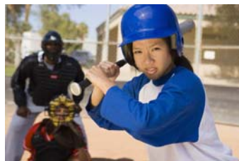
Table 1. Six features of positive developmental setting of youth sports program (National Research Council & Institute of Medicine, 2002).

While urban parks and recreation programs recognize the importance of offering and delivering a variety of sports programs to urban youth within a positive developmental setting (see Table 1) and have developed partnerships with various professional sport organizations to provide opportunities to develop positive youth attributes (e.g., the Bears inner city flag football program, the PGA First Tee program, and MLB's Reviving Baseball in Inner Cities), these programs cannot succeed without addressing safety-related barriers (e.g., gang violence, crime, unsafe facilities, poorly maintained fields) (Reis et al., 2008) and opportunity and access-related barriers (e.g., dysfunctional families) to participation (Fukuzawa, 2000). Although much is known about factors contributing to the positive development of young people through community youth sports-based programs (Perkins, Jacobs, Barber, & Eccles, 2004; Perkins & Noam, 2007; Peitlpaas, Cornelius, & Van Raalte, 2008; Weiss, 2004), and barriers to participation (Bocarro, 2002; Perkins et al., 2007), how the first of the six features of positive developmental youth sport settings, physical and psychological safety, impacts the delivery of urban youth sports programs is an understudied phenomenon.