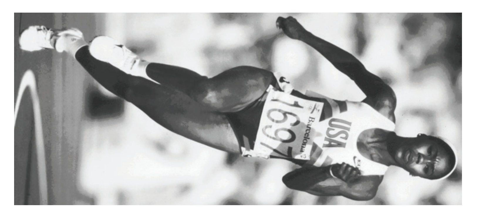
Tucker Center for Research on Girls Women in Sport University of Minnesota 203 Cooke Hall, 1900 University Ave. SE

203 Cooke Hall, 1900 University Ave. SE Minneapolis, MN 55455 612-625-7327 vox | 612-626-7700 fax crgws@tc.umn.edu http://www.kls.umn.edu/crgws/