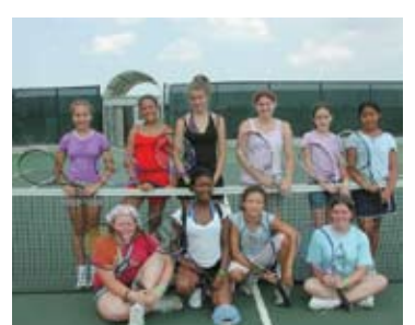
Teen Girls Tennis & More

There are numerous grass roots programs around the country that make a positive impact on girls through their involvement in sport and physical activity. But two such programs with a Minnesota connection exemplify the many individuals who use their gifts, time, and what little resources are available to truly make a difference one girl or one team at a time. Teen Girls Tennis & More is part of The Fort Snelling Tennis & Learning Center (FSTLC). The FSTLC mission is to assist and encourage less-advantaged and culturally diverse youth in achieving a greater sense of empowerment and personal responsibility through tennis and education. Teen Girls Tennis & More includes learning fundamental skills and drills as well as a life-skill component. The latter involves discussion time for girls to talk about whatever is on their minds. Meeting in twice-a-week sessions, the girls arrive from various Minneapolis locations (e.g., neighborhood parks) on "The Big Blue Bus." This eases the transportation barriers that often preclude young girls from